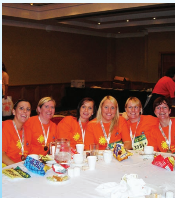
Participants of the Mini Marathon 2007