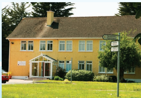
The Children's Sunshine Home, Leopardstown.

We have always recognised the importance of the family home and we continue to emphasise this in the support and services which we offer. Far from being bound to the perimeter of our premises, our caring approach extends to wherever the child is at any given time - whether this be in the care of a hospital or at home with the family.