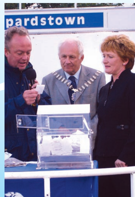
Leopardstown Lions Race Night 2006